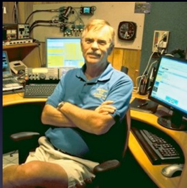
VEIRGB Local Support Halifax