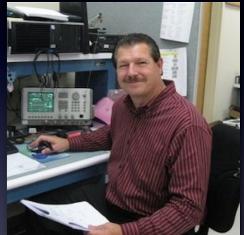
K3LP - Station Design Consultation