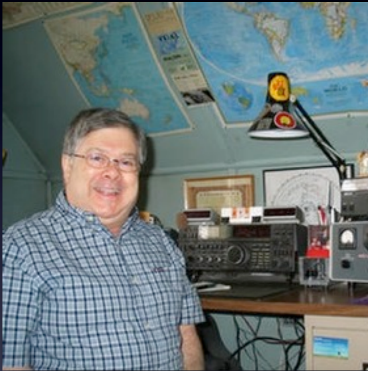
VEIAL - Local Support Sydney