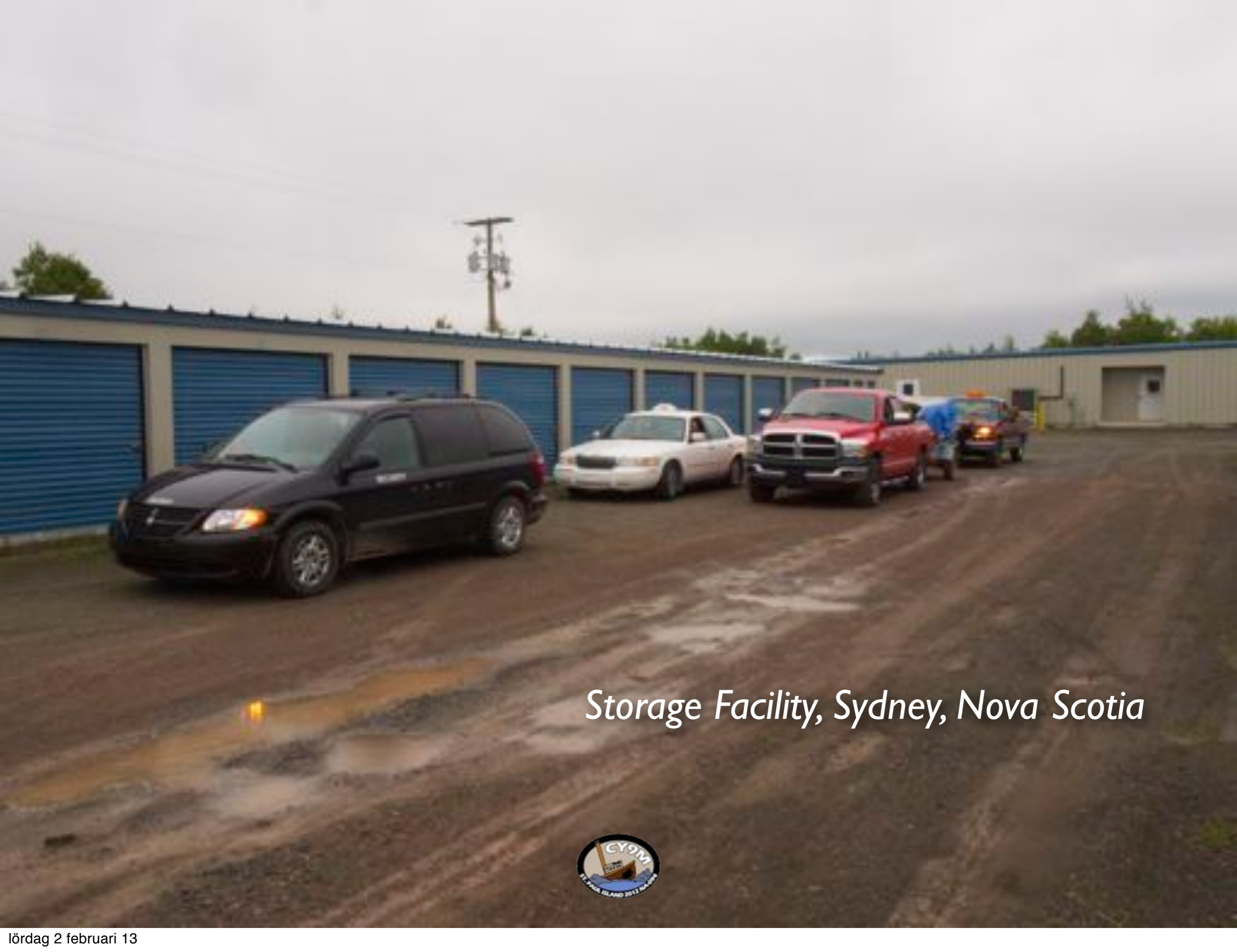
Storage Facility, Sydney, Nova Scotia